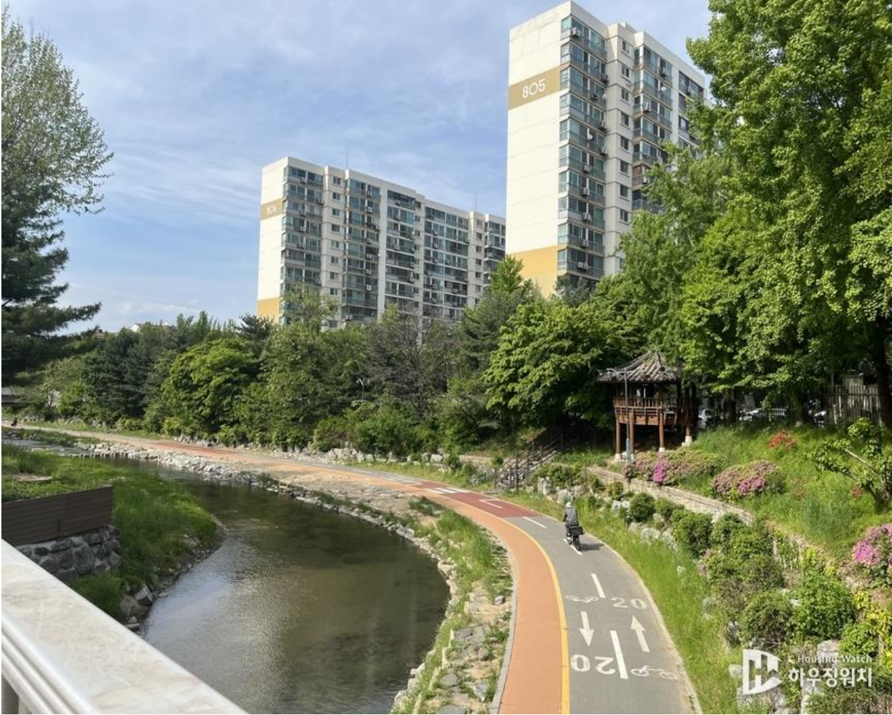
View of the 8th & 9th APT Complexes of Gwacheon from the walking & biking path along Yangjaecheon Stream